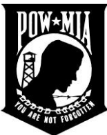
National League of POW/MIA Families