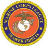
Marine Corps League